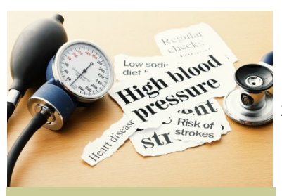
Special Points of interest:

"Eating fresh fruits and vegetables and cutting back on salt can drop high blood pressure by 5 points."