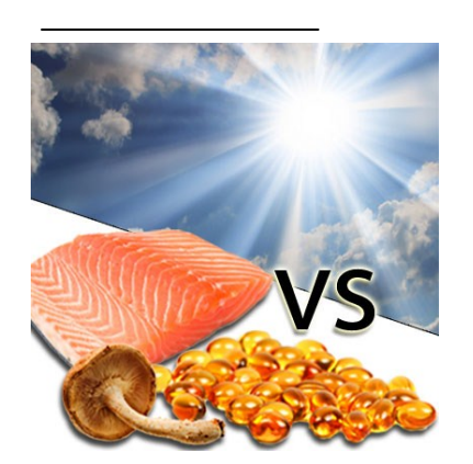
"Can too much vitamin D be harmful? Signs of high levels of vitamin D include nausea, vomiting, poor appetite, constipations, weakness and weight loss.